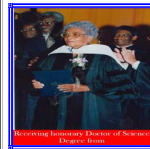
Receiving honorary Doctor of Science Degree from

Her reputation as an educator has extended national boundaries and has been solicited by various regional and international organizations. She has provided consultancy services for the Pan American Health Organization (P.A.H.O), CARICOM Secretariat, Organization of