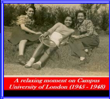
A relaxing moment on Campus University of London (1945 - 1948)